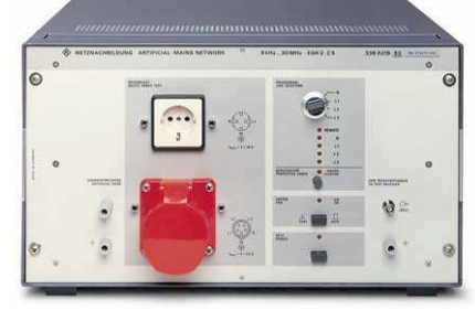
ESH2-Z5 (photo 35326)

AC supply provides automatically controlled or permanent cooling, as required.